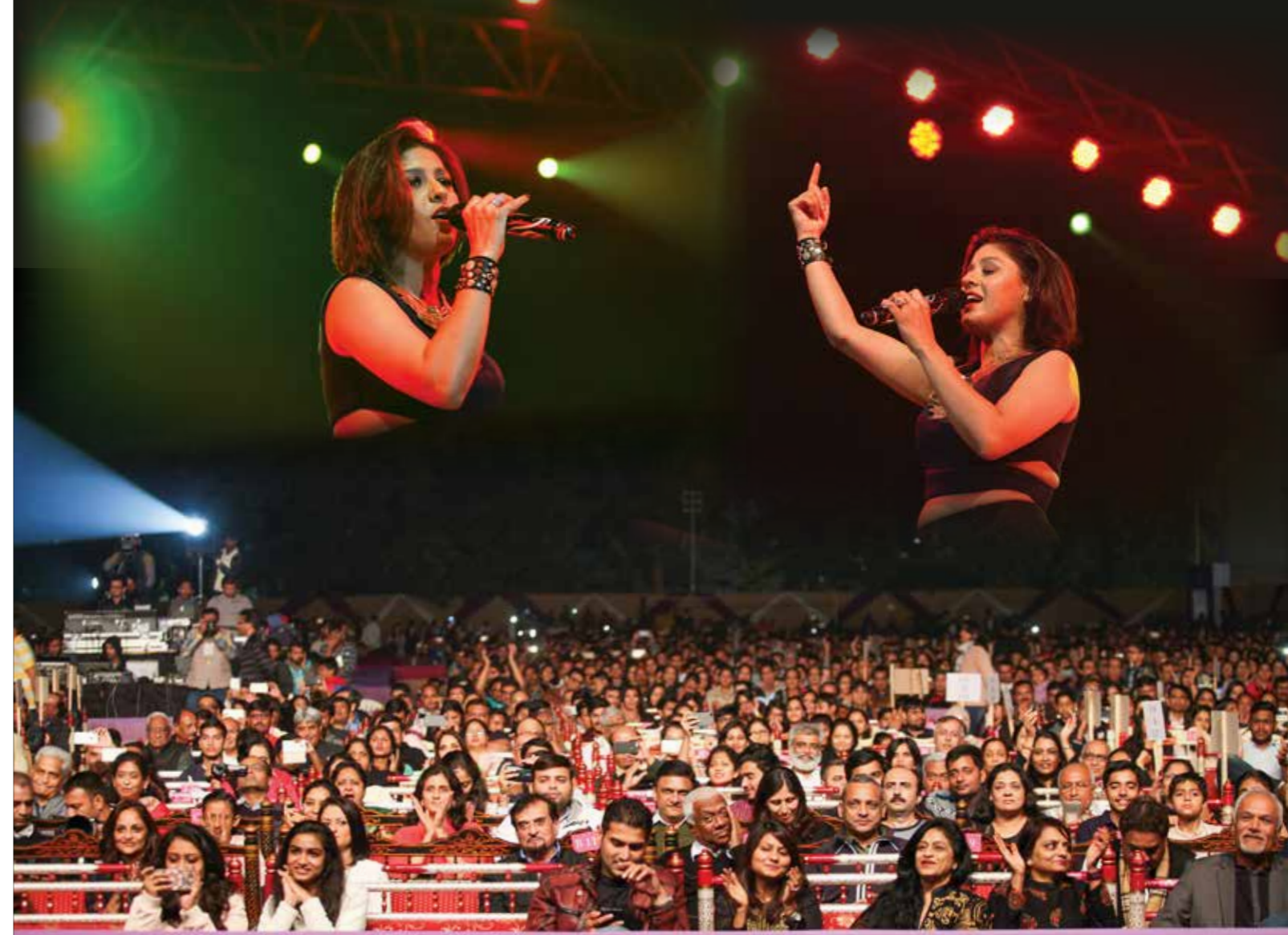
An audience of more than 5,500 attended renowned singer Sunidhi Chauhan's performance – a Charity Show which helped raise Rs. 150 lakh for treatment of needy patients.

women, children and members from economically-disadvantaged sections of the community, so as to create gender equality and reduce inequalities faced by socially and economically-backward groups. The programmes cover: ◦ Enabling free stay to patients in general wards of the Hospital to make treatment more affordable; ◦ Free and or/substantially free treatment of women and children from Below-the-Poverty-Line (BPL) and other economically-disadvantaged families and highly-subsidised treatment for men from such families; ◦ Providing subsidised treatment to underprivileged patients suffering from cancer and cardiac ailments.