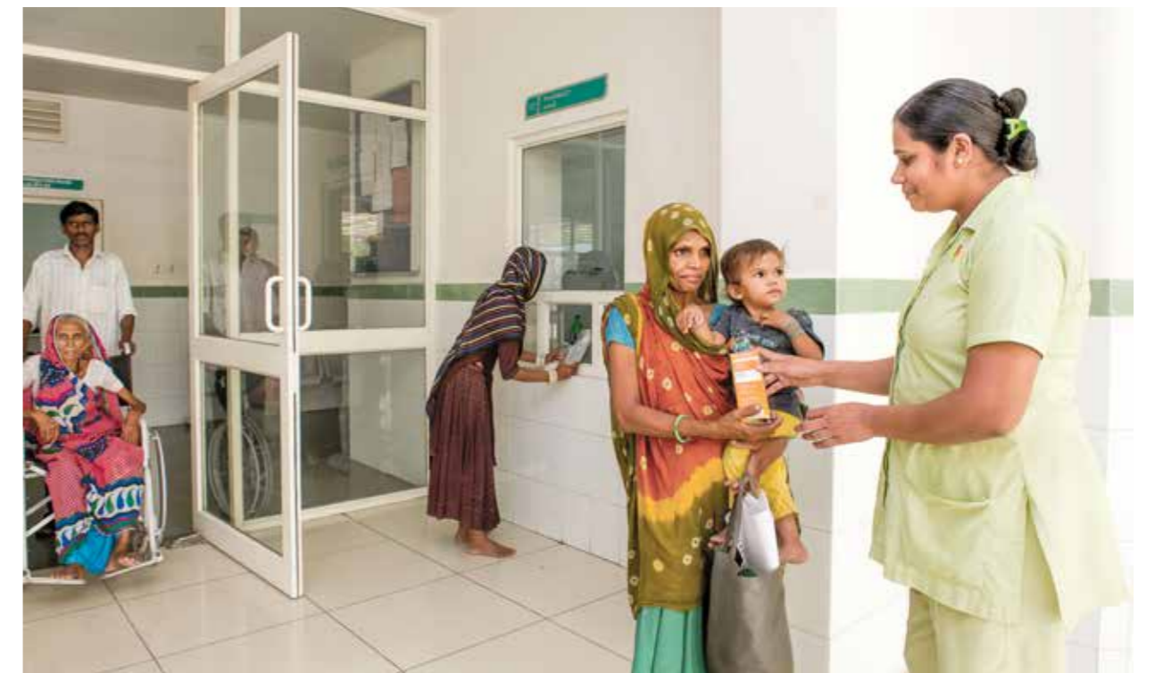
Needy patients from villages are assured of quality treatment at the Sevaliya Centre.

A blood donation camp was organised in col-