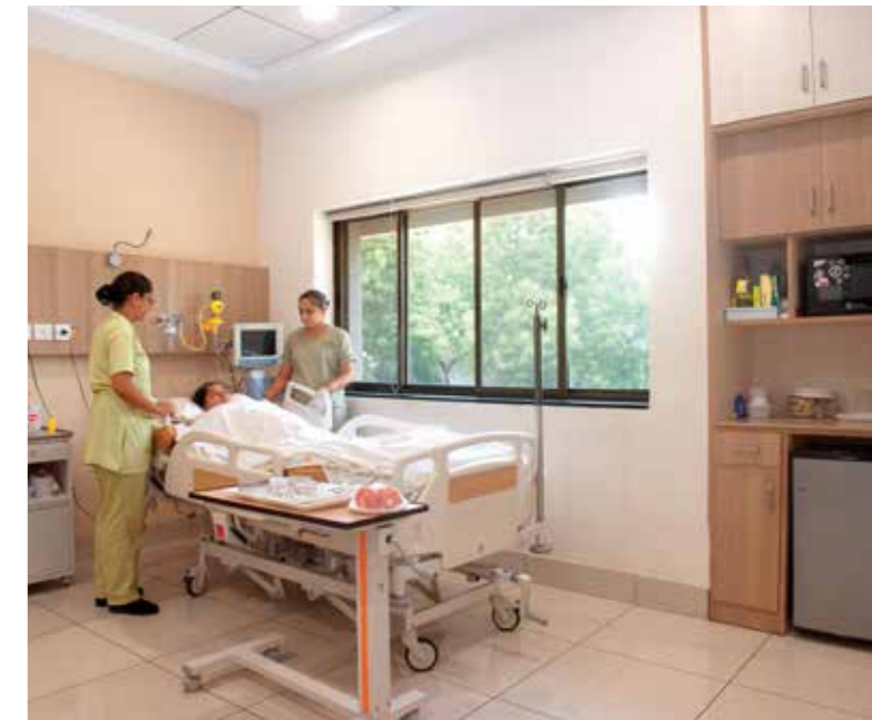
The Ramanbhai Gokal Privilege Centre provides personalised care and premium facilities.

The Ramanbhai Gokal Privilege Centre treated 29,506 outdoor patients and 2,441 indoor patients. Around 6,000 members enrolled in the Centre's preventive health check-up programme, 'Hello Health'.