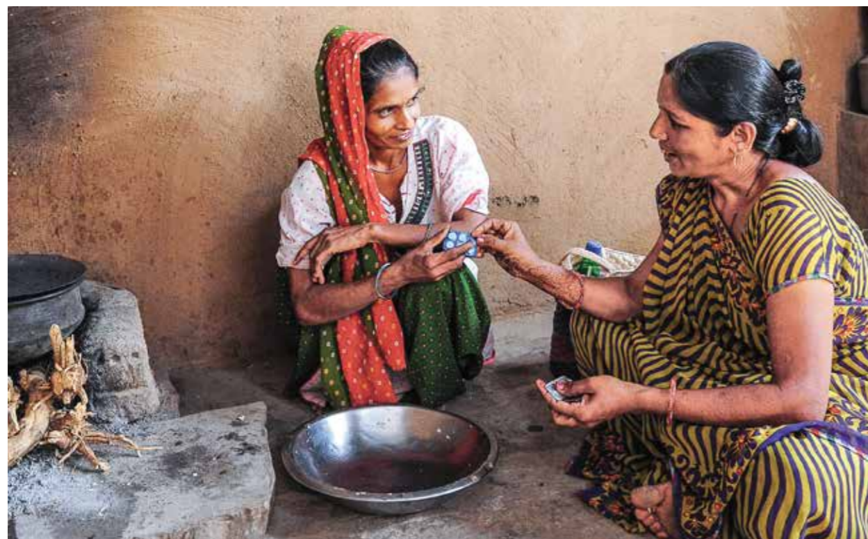
The Village Health Worker provides the vital link between patients in the villages and the Shree Krishna Hospital.