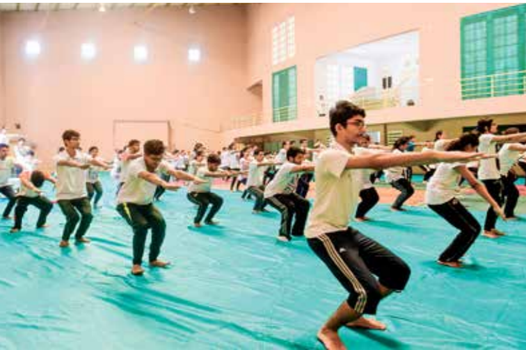
Students celebrate Yoga Day. They are encouraged to engage in extra-curricular activities.